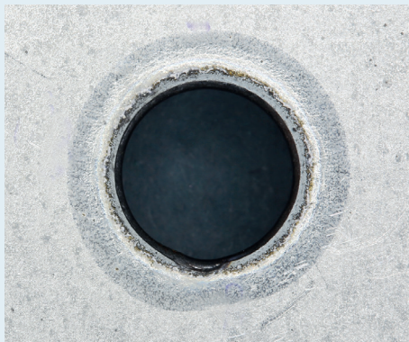
1 Laser edge finishing process. 2 Laser edge finished specimen for hole expansion test.